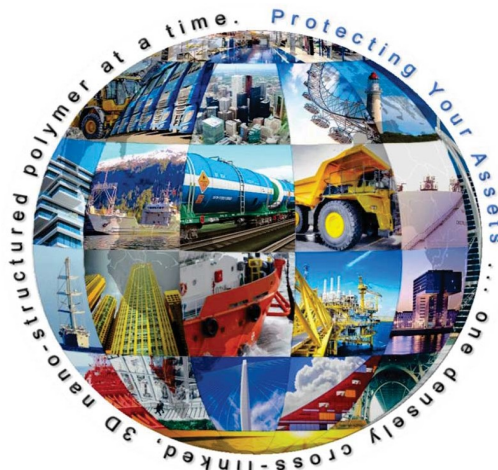
Nano-Clear 3D Polymer

Telephone: (810) 227-0077 https://www.nanocoatings.com info@nanocoatings.com